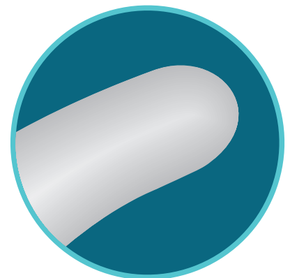
Pelvis Side Closed Tip

** Set available with guidewire, suture, clamp etc. # Hydrophilic coating on stent as per requirement.